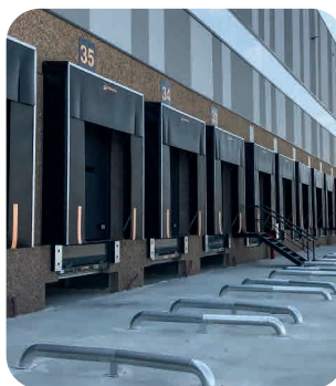
Fully Galvanised Reversible Lorry Guides.