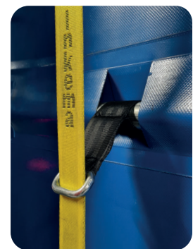
Reinforcement and double strap.