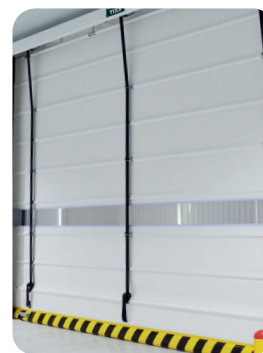
Vertical belts connected to the ribs.