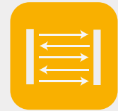
Safety Light Curtain.