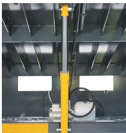
Elevation Cylinder with Anti-Fall Valve.