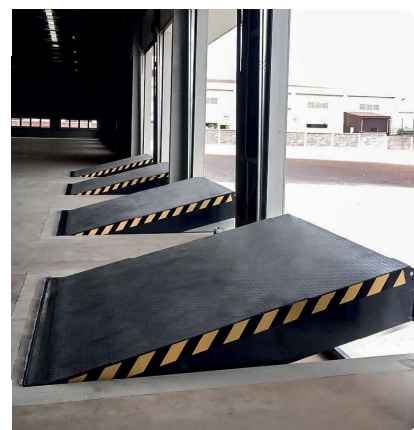
RH11B Suitable for any Industrial Sector