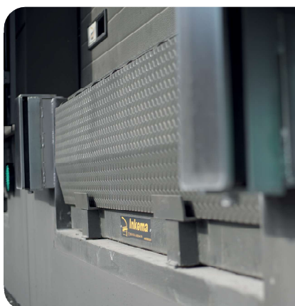
RH11B Perfectly Installed on a Dock