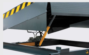
Toe Guard for Feet Protection