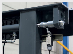
Perimeter footrest system